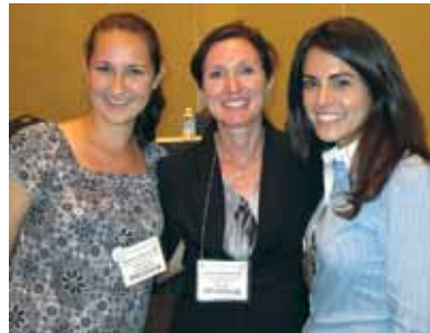
Diversity Committee members