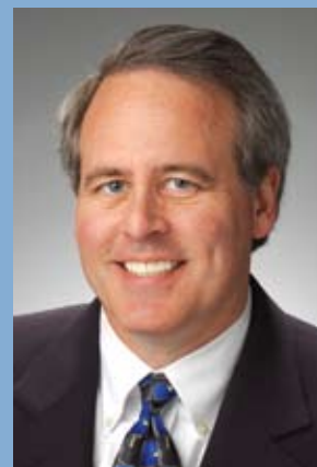
Raymond K. Mulhern, Ph.D. July 10, 1949 – July 2, 2005

The Memphis Downtown Marriott will serve as the conference site. Call the hotel at 800-228-9200 and ask for the St. Jude Behavioral Medicine Conference special rate of $105/night.