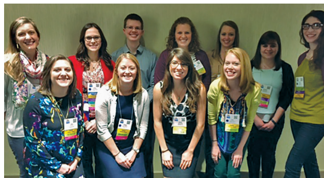
Student Advisory Board Members gather at #SPPAC 2016.

During the conference, we honored the SPP award winners with moving talks commemorating their contributions to SPP. New this year was Internships and Postdoctoral Fellowships on Parade—a resounding success with over 30 programs represented.