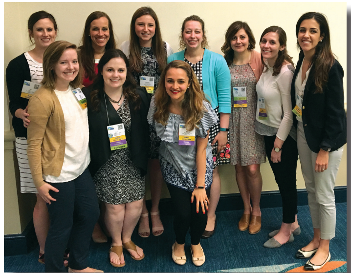
SPP Student Advisory Board at the 2018 SPPAC in Orlando.

We thank the SPPAC 2018 conference committee, the student ambassadors, our generous conference sponsors, and all who participated in the conference for ensuring its success. We look forward to another exciting SPPAC in New Orleans next April!