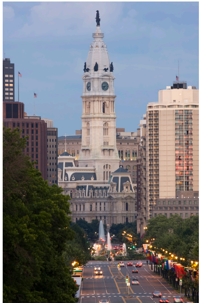
City Hall, in the heart of downtown ("Center City") Philadelphia

William Penn's gridiron city plan, dating back to the 1600's, makes Philadelphia a very walkable city. Numbered streets go North/South and many of the East/West streets have names of types of trees (Chestnut, Walnut, Locust, etc). The Loews is centrally located in Center City; you are walking distance to all the historical sites and many museums in Old City, scenic Rittenhouse Square area (there is an actual square park surrounded by restaurants and shopping down Walnut St), and the museum district that includes the Philadelphia Art Museum, Barnes Foundation, Franklin Institute, etc. In the immediate neighborhood, within about a 4 block radius, you will find many eating options and fun shops. More information is available at the registration table or from the hotel.