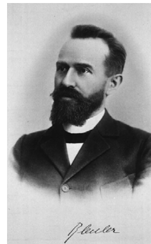
Paul Eugen Bleuler (1857-1939) was a Swiss psychiatrist known for his contribution to the understanding of mental illness. He coined the term "schizophrenia". Bleuler considered pediatric delirium to be unimportant because children became delirious easily and often. Opinion has changed since then.