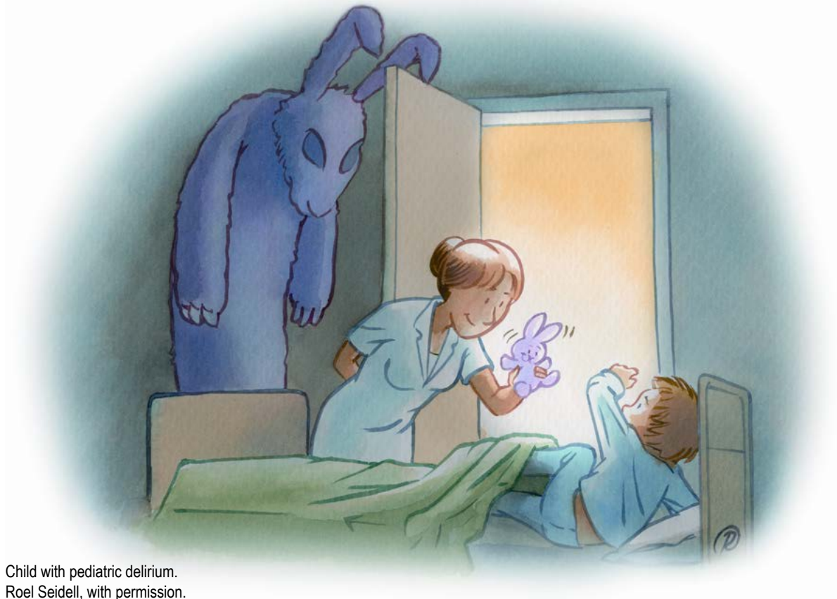
Child with pediatric delirium.

The diagnosis of delirium in children older than 5 years with normal development is based on DSM-5 or ICD-10 criteria. Accurately diagnosing pediatric delirium requires using a reliable, valid and clinically suitable bedside tool that may also serve for screening and to guide treatment such as the Pediatric Anesthesia Emergence Delirium Scale (PAED; Sikich & Lerman, 2004); the pediatric Confusion Assessment Method for ICU (pCAM-ICU; Smith et al,