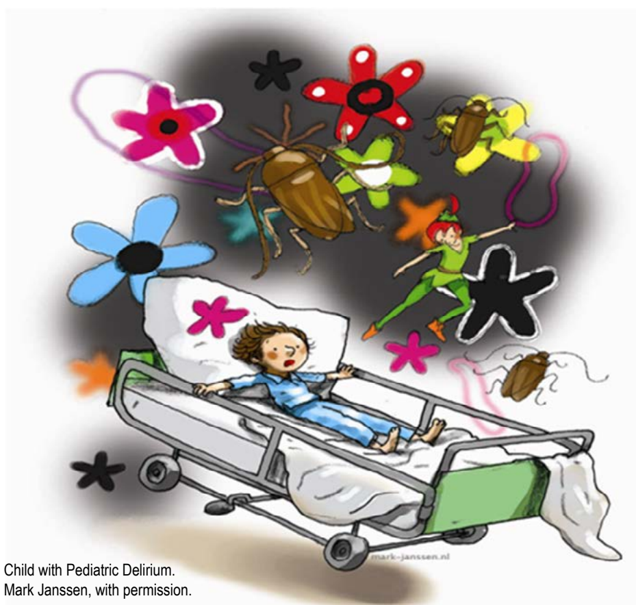
Child with Pediatric Delirium.